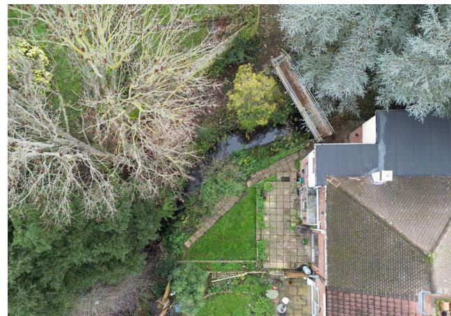
Bedroom 6'11" x 8'7"